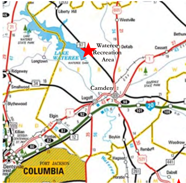
Wateree is located approximately 35 miles north of Shaw AFB. It is 9 miles northwest of Camden on SC 97.

All other facilities, equipment and tent sites are on a first come, first served basis.